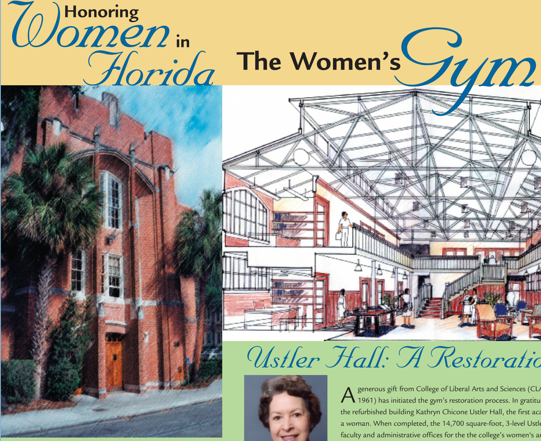
A Historic Opportunity...

3324 Turlington Hall PO Box 117352 Gainesville FL 32611-7352 352-392-3365 352-392-4873 Fax